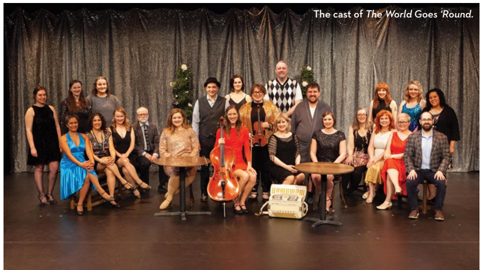
The cast of The World Goes 'Round .