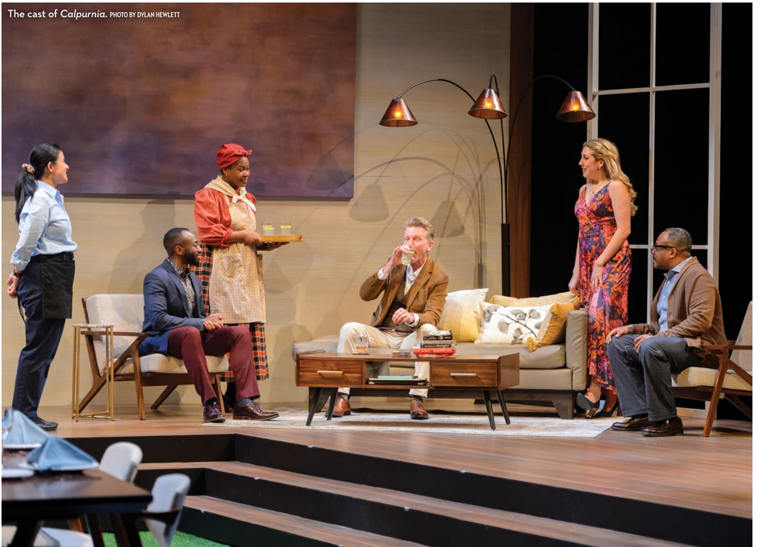
The cast of Calpurnia .