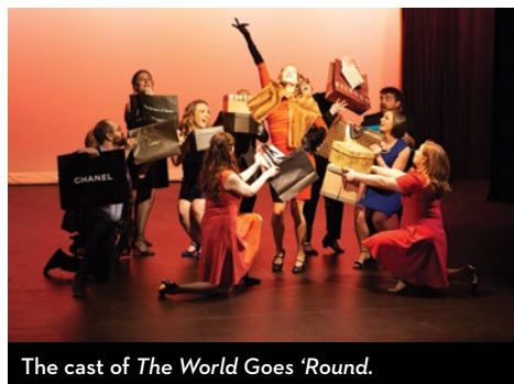
The cast of The World Goes 'Round .