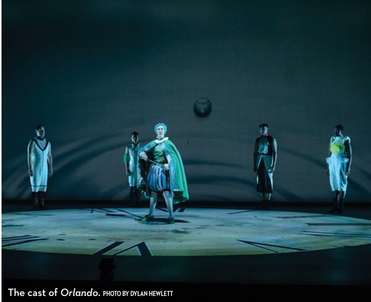
The cast of Orlando .