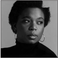
Katori Hall Playwright

Olivier Award-winning and two-time Tony-nominated Memphis-native Katori Hall is the bookwriter and co-producer of the West End and Broadway hit, Tina: The Tina Turner Musical . She's also the executive producer and showrunner of P-Valley , the breakout Starz drama based on her play Pussy Valley . Katori's latest piece, The Hot Wing King , premiered in Spring 2020 at the Signature Theatre, rounding out her three-play residency. She is best known for The Mountaintop , which won the Olivier Award for Best New Play in 2010 before opening on Broadway in October 2011 to critical acclaim. Katori's other works include the award-winning Hurt Village , Hoodoo Love , Saturday Night/Sunday Morning , Our Lady of Kibeho and The Blood Quilt . She is also the director of the award-winning short, Arkabutla . Katori is an alumna of Columbia University, ART at Harvard University and Juilliard. She's also a graduate of the Sundance Episodic Lab's inaugural class, the Sundance Screenwriting Lab and Ryan Murphy's Half Foundation Directing Program. She is a proud member of the Ron Brown Scholar Program and the Coca-Cola Scholar Program. She's currently developing multiple projects across film, television and theatre.