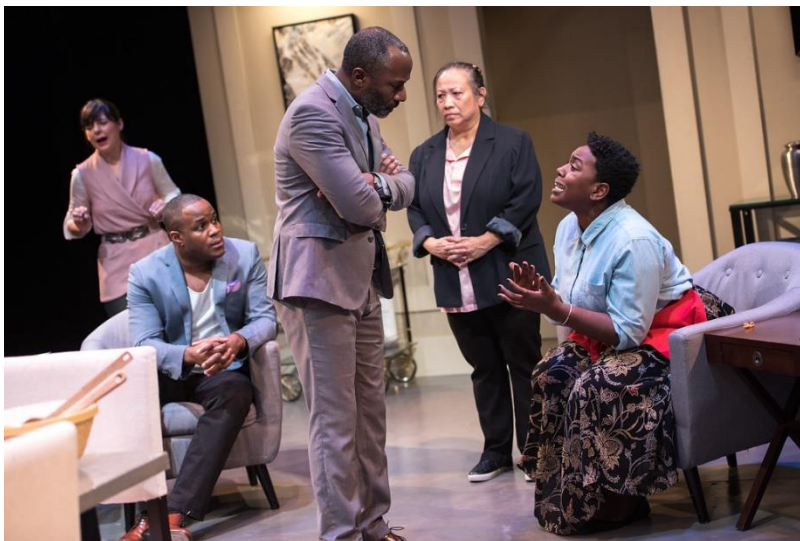
Cast of the Nightwood Theatre/Sulong Theatre production.

Understanding: A just society respects human diversity and recognizes universal, equal, and unalienable human rights.