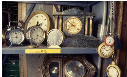
Props storage is full of diverse items. Keeping them organized helps the props department make selections to show the designer based on what fits in the world of the production.